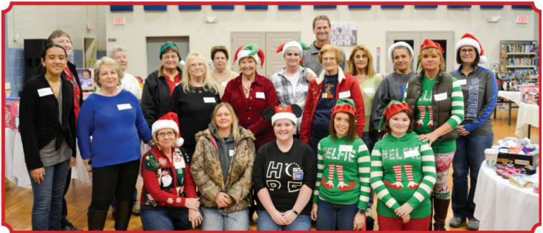
The volunteers of the Christmas Toy Store take a break from a busy evening just long enough for a quick photo.